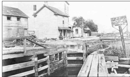
Above: Lock 21 East in Jersey City